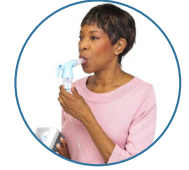
Albuterol sulfate or Xopenex ® (Sunovion Pharmaceuticals Inc.) or Levalbuterol HCl

Please see all prescribing information for all products.