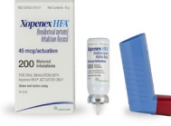
Xopenex HFA ® (Sunovion Pharmaceuticals Inc.) or Levalbuterol tartrate