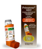
Primatene ® MIST (Amphastar Pharmaceuticals) or Epinephrine