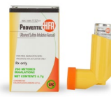
Proventil ® HFA (Merck Sharp & Dohme Corp., a subsidiary of Merck & Co., Inc.) or Albuterol sulfate