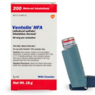
Ventolin ® HFA (GlaxoSmithKline) or Albuterol sulfate