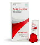
ProAir RespiClick ® (Teva Respiratory, LLC) or Albuterol sulfate